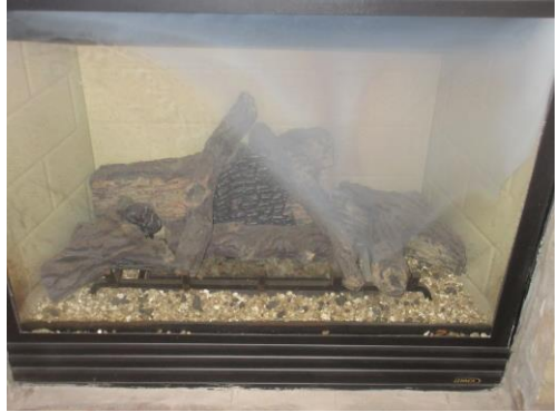
Fogged glass at the Heatilator